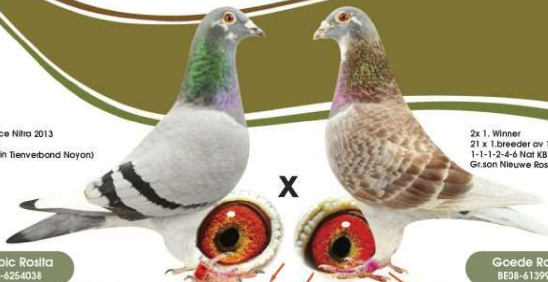
Olympic Rosita BE12-6254038

2x 1. Winner 21 x 1. breeder av 1.250 1-1-1-2-4-6 Nat KBDB ace breeder Gr.son Nieuwe Rossi x Eenoojske